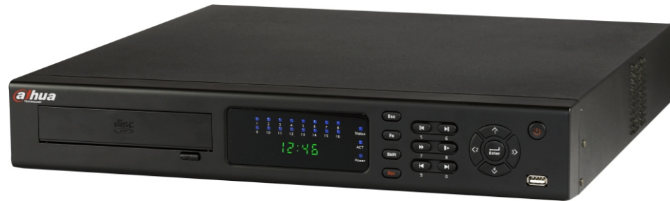
DH-DVR0404LE-L DH-DVR0804LE-L DH-DVR1604LE-L